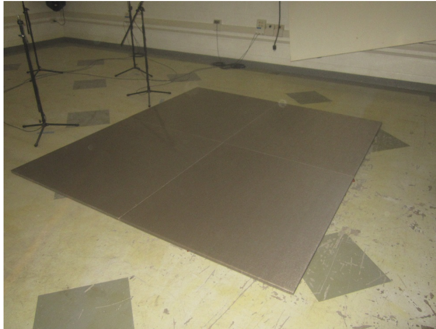
View of Installed Specimen